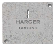
Standard Lid Engraving