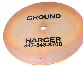
Top View of Cover