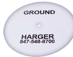
Top View of Cover