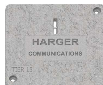
Custom Engraving Available. Contact factory for details.