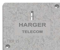
Custom Engraving Available. Contact factory for details.