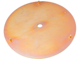
Inverted View of Cover