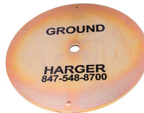
Top View of Cover