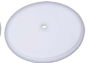
Inverted View of Cover