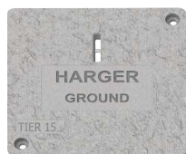
Standard Lid Engraving