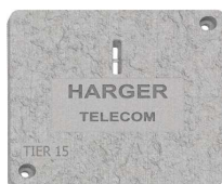
Custom Engraving Available. Contact factory for details.