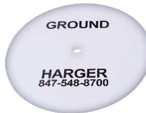
Top View of Cover