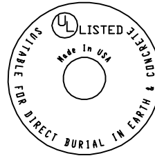
DIRECT BURIAL LABEL